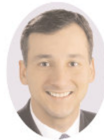
Bernard Lord New Brunswick / Nouveau-Brunswick