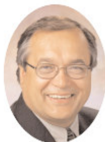
Joe Handley Northwest Territories / Territoires du Nord-Ouest