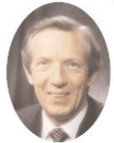
Lorne Calvert Saskatchewan