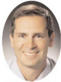
Dalton McGuinty Ontario