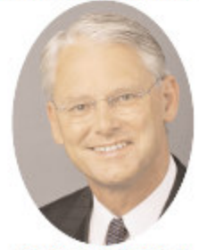
Gordon Campbell British Columbia / Colombie-Britannique