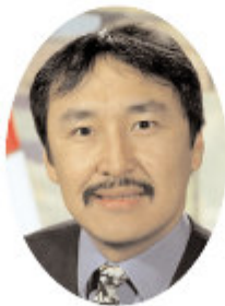
Paul Okalik Nunavut