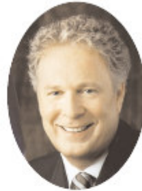
Jean Charest Québec