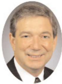
Pat Binns Prince Edward Island / Île-du-Prince-Édouard