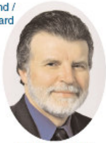
Dennis Fentie Yukon