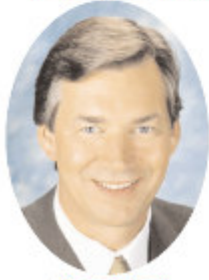
Gary Doer Manitoba

August 10 – 12, 2005 / 10 – 12 août 2005