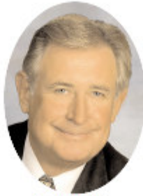
Ralph Klein Chair / Président Alberta